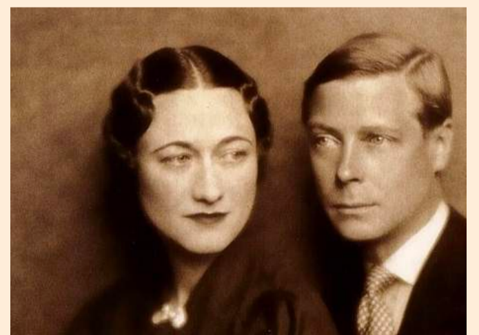
Wallis Simpson and Prince of Wales, Edward VIII