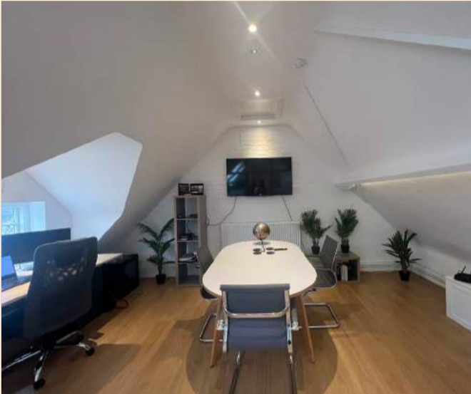
A business park with a difference ...