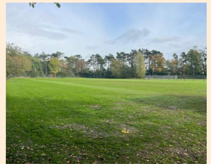
Ticketed dog show in the heart of the countryside

refreshments and to receive a goodie bag. All entries are £15 per person.