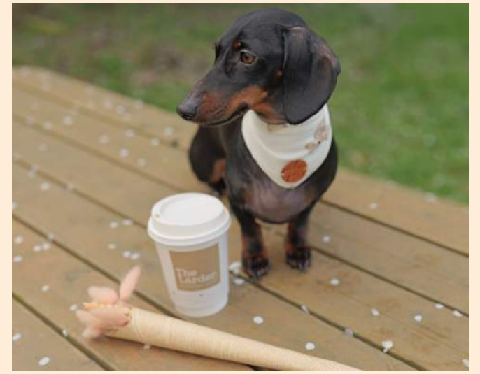
Time to show off those paws & meet likeminded people

head out on the ride, with the Get Busy Living Centre here at Burrough Court and home to the Matt Hampson Foundation being one of the allocated feed stops at 27km. There are 100km and 50km loops on offer. The 100km route features 1281m of climbing and requires a reasonable level of cycling fitness, whilst the 50km route can be tackled by all abilities and features 776m of climbing. A GPX file will be sent to participants before the day of the ride. After the ride, riders will be able to gather back at the store for