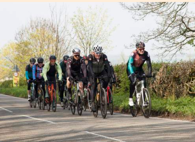
Book your 100km or 50km cycle on Sigma's eventbrite page called 'The Sigma Sport CiCLE Classic Sportif'