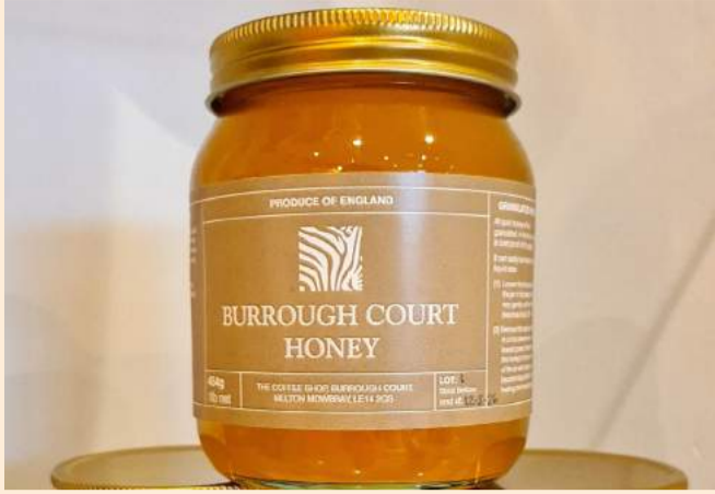
£6.95 a jar from the Larder, Burrough Court