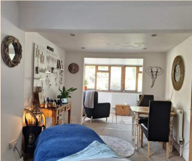
An office or a treatment room - you decide!