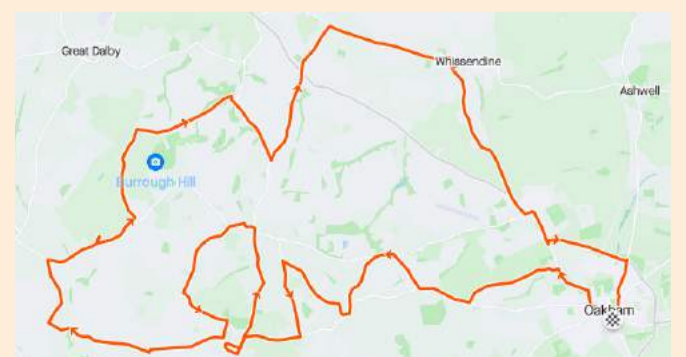
The route map